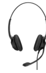
IMPACT 200 Series