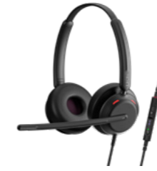
IMPACT 700 Series