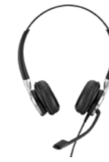
IMPACT 600 Series