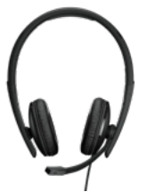
ADAPT 100 Series