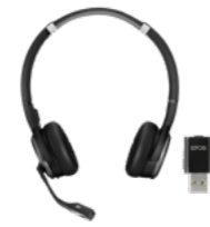
IMPACT 5000 Series